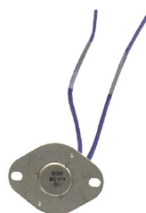
Maverick Thermostat without Bracket